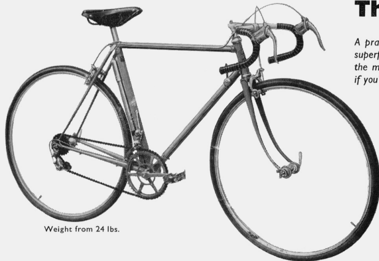
Weight from 24 lbs.

Quotation for alternative finishes with pleasure.