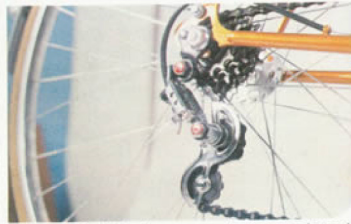
Finely finished rear ends brazed and polished by hand, for strength and appearance

Skill-Pride-Experience, the extra ingredients that make Claud Butler