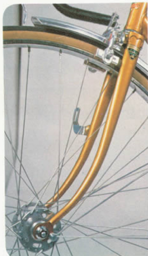
Butted Reynolds 531 fork blades, a feature on all Claud Butler frames