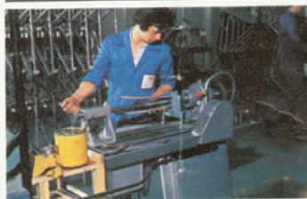
Precision machining to ensure accurate fitting of head and bracket bearings