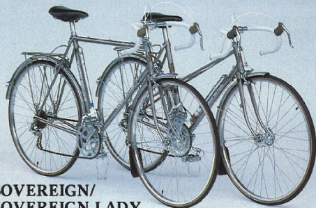
SOVEREIGN/ SOVEREIGN LADY

A very popular matching pair of touring bicycles. Built with Reynolds 531 main tubes and forks with 72° angles for a superbly comfortable ride. Ladies version has "mixte" style frame with a special padded "anatomic" saddle. Both have Sun Tour 10 speed wide ratio gears and a rear carrier, alloy pump and quick release wheels. Finished in metallic Gold, with Silver ESGE full mudguards. Gents Majestic available in sizes 21½", 22½", 23½", 24½", 25½". Majestique in 20" and 22".