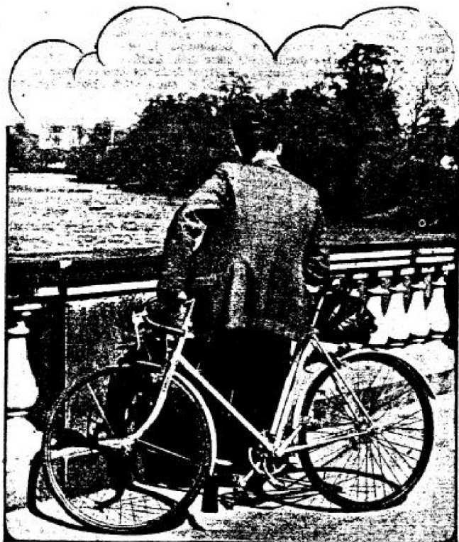
The Grubb "Silver Flash" in the peacefulness of a London park.

I rode the machine for just over a week, into which, unfortunately, I could crowd only one long country run; nevertheless I came to the sincere conclusion that it was not only a well-