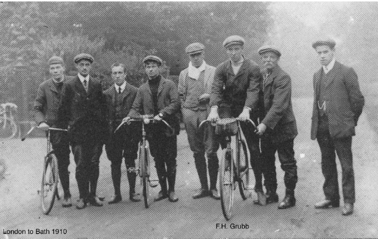
London to Bath 1910